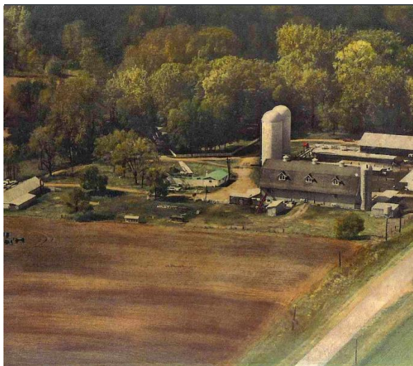
Cricklewood Farm Aerial (1960)