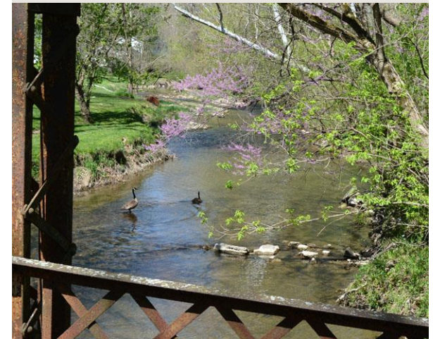
Cool Creek at Cricklewood Farm (2017)