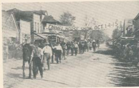
Carmel Before The Fire in 1913

The first meeting for Divine worship ever held