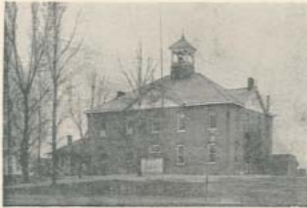
The Old School South of Carmel.

ject. The Carmel High School Alumni Association championed the landscaping project which helped to give to Carmel one of the most beautiful educational institutions in central Indiana.