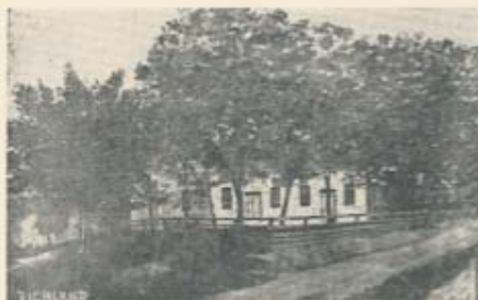
The Old Richland Friends Church.

The early followers of George Fox sought refuge in America in the latter half of the 17th century. They spread rapidly from Boston into Pennsylvan-