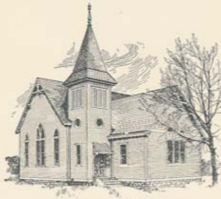
The New Richland Friends Church.

In 1833, the Preparative Meeting erected the first place of worship, a one room log house, 18 by 20 ft., located on the south side of the present cemetery. In 1835 another room of the same size was added. A new frame building was constructed on the same ground in 1845, and the church now, occupied by Friends was dedicated March 4, 1893.