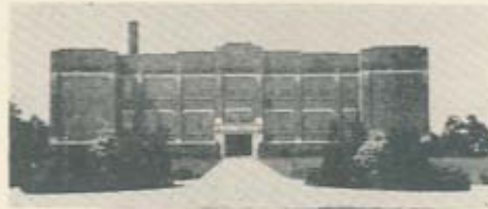
The New School in Carmel.

Space forbids the listing of every principal and teacher who have made worthwhile contribution to the life of the community during the past one hundred years.