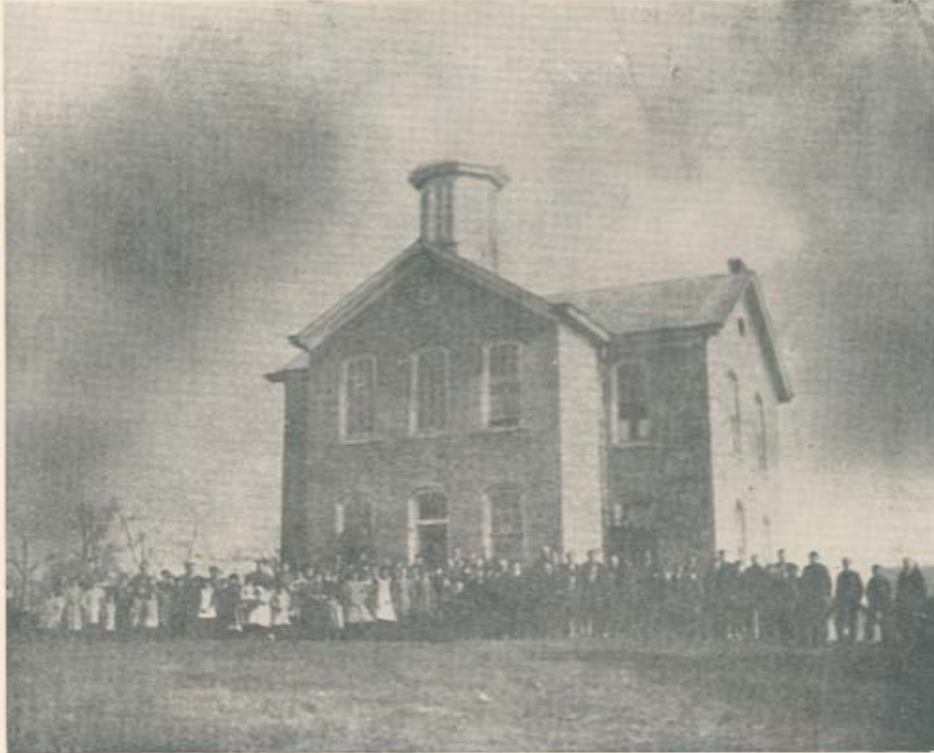
The Old Richland School

Carmel, known as Bethlehem a hundred years ago, was settled by the type of people who had abundant faith in the three fundamental institutions of society, the home, the church, and the school. Thus, when a score or more homes had been built in the forest, a feeling of need for a place of worship and a place where the children could be educated led to the building, 1833, of a log meeting house which served also as the first school house. This building was doubled in size in 1835. It stood on the ground now occupied by the Carmel cemetery. This church and school was known as Richland.