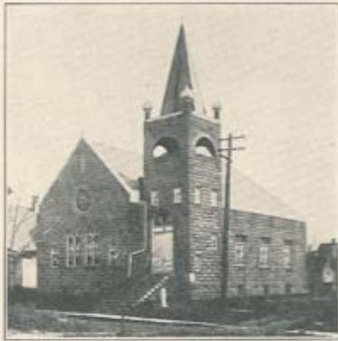
The Methodist Episcopal Church