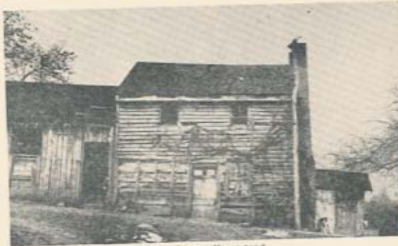
The Kinzer Homestead

She did her own work and was a great walker, going 2 or 3 miles. She was what is called "Dutch" and her Bible was in that language.